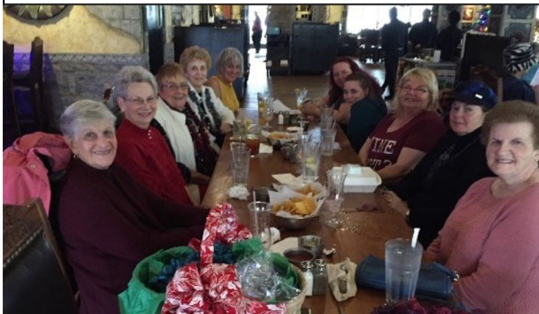
December Lunch at Plaza Azteca

This month, the group will meet for lunch Monday, January 13th, at 12:30PM. They meet at "Applebees" in the ping Center, Norfolk.