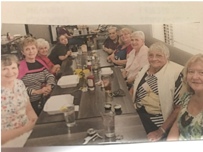
LADIES LUNCH AT BRICKHOUSE DINER IN AUGUST